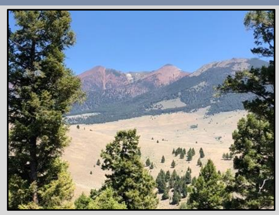
19.6 acres of land bordering State Lands on two sides at the end of the gated road with elk and deer hunting, trees, and amazing Highland Mountain views.

This Montana hunting property borders State Lands on two sides out in the mountains of Montana. You've got all these extra public lands right next to your property that you can just take off and hunt too. It's a huge bonus to have these lands right there next to you to hunt and recreate on. Set up stands and hunt your own property for elk and deer or take off after them wherever they may be roaming for the day. You'll hear elk bugling in the fall and you can glass the open parks and hillsides right from your property and go hunt them from there. You can hunt both elk and deer with a general tag and there's extra cow elk tags you can draw for a second elk as well since the elk are so plentiful in Hunting District 340. There's thousands and thousands of acres of BLM lands in the area and it's only a few miles back up the road to the National Forest as well for tens of thousands of more acres you can hunt and explore in the Highland Mountains. There's lots of country that's yours to enjoy right at your fingertips, and its wide-open spaces for you to have and enjoy for decades to come.