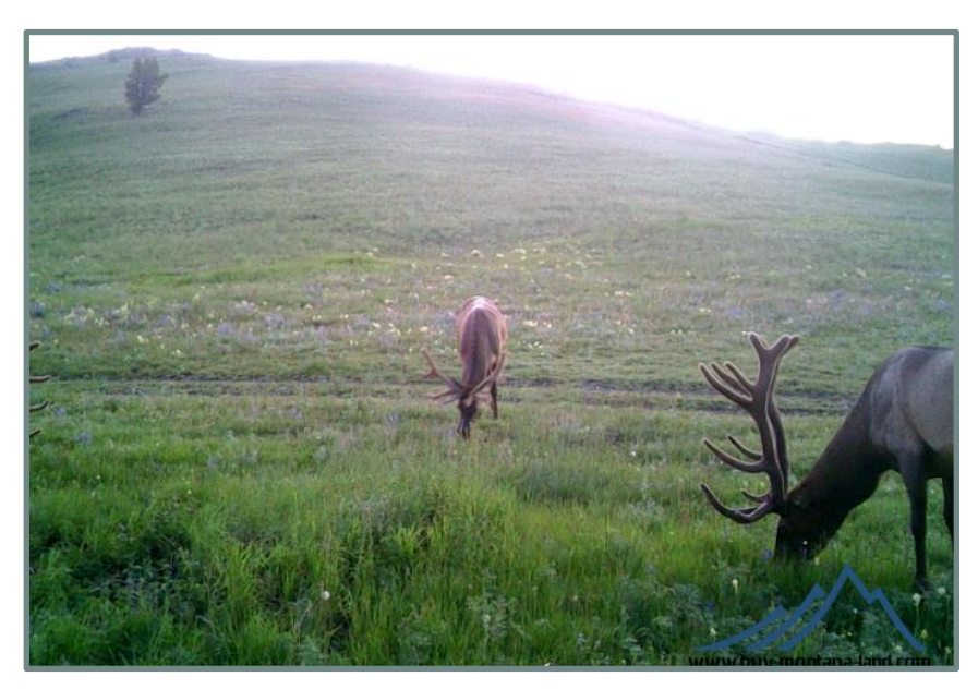
This 20.2 acres of property borders the Helena National Forest on 2 sides and you're way out in the National Forest where you can go in any direction and hunt, hike, and enjoy the tens of thousands of acres of National Forest all around you. It's like you're buying a whole lot more land with all this extra easily accessible land right out your front door that's yours to enjoy as well as any time you take a notion.

You can pull your camper in and start enjoying immediately while you make plans to build that cabin in the mountains you've always wanted. Make sure you build it with lots of windows and face them towards the distant views of all the mountain ranges like the Tobacco Root Mountains, The Highland Mountains, the Bull Mountains, and you've got the Elkhorn Mountains right there close out your front door. And be sure to build a big deck so you can sit out and listen to the elk bugle in the fall and watch the sunsets over the Rocky Mountains. There's already a leveled site built so it'll be ready to start planning and building a Montana mountain cabin whenever you are. Or bring up a wall tent or camper and have a place in the Elkhorn Mountains of your very own that you and your family can enjoy and pass down through the generations. And the property is at the end of a private gated road with no other easements or easement roads through it. What a feeling to know you've always got a place to go get away and relax and get back to nature.